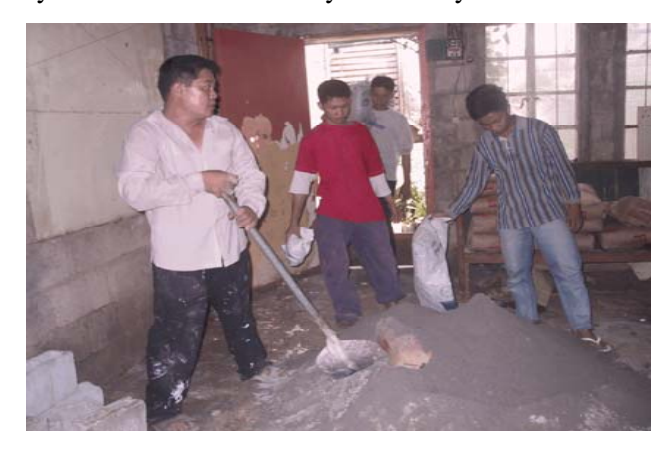
Construction funded by U.S. charity

May the Lord bless each of you for all you do for the work of God in Asia.