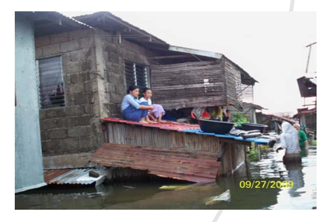
Flooding in Calamba

Send all articles and contributions for the publication of the AV Newsletter to: